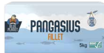
Pangasius Blue Planet Natural fillet

Blue Planet fish is responsibly farmed fish, because only that fish has a future.