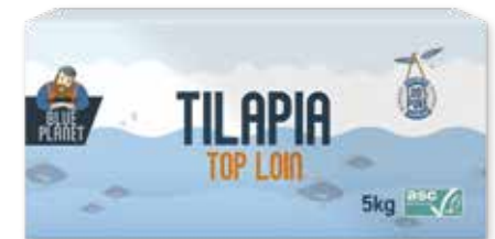
Tilapia Blue Planet Top Loin