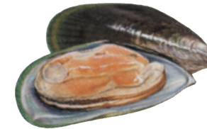
Mytilus chilensis Perna canalicula