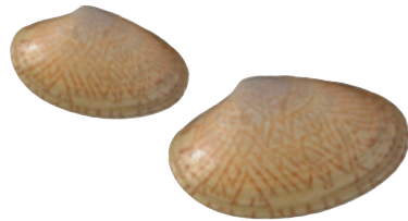
Paphia undulata Meretrix lyrata

BREEDING / OFF SEASON | HARVEST / CATCH SEASON | PEAK HARVEST/CATCH SEASON